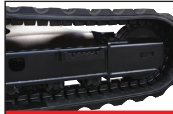
Triple Flanged Track Rollers