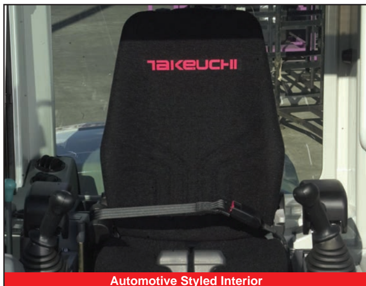
Automotive Styled Interior