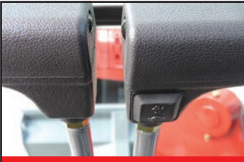
2-Speed Travel w/ Auto Shift