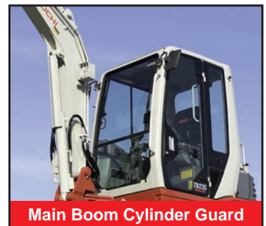
Main Boom Cylinder Guard