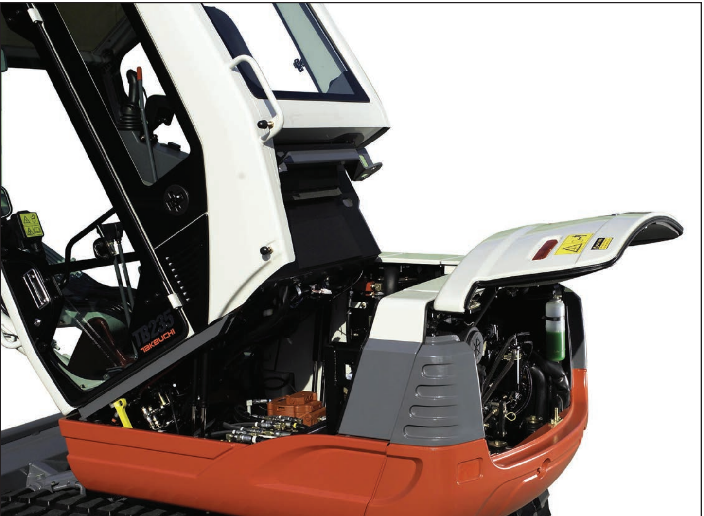
Large lockable service hoods and tilt-up cabin provide outstanding maintenance access.

The interior provides excellent operator comfort with pilot operated controls, travel controls with large foot pedals, easy to reach rocker switches and a throttle lever control.