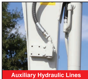
Auxiliary Hydraulic Lines