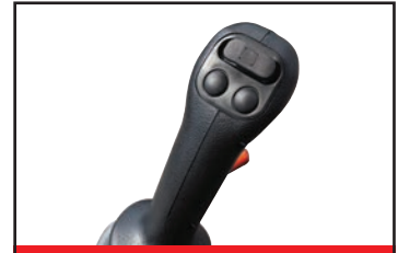
Hydraulic Pilot Joysticks

Delivering outstanding performance and versatility, the TB235 is one of Takeuchi's most popular conventional tail swing excavators.